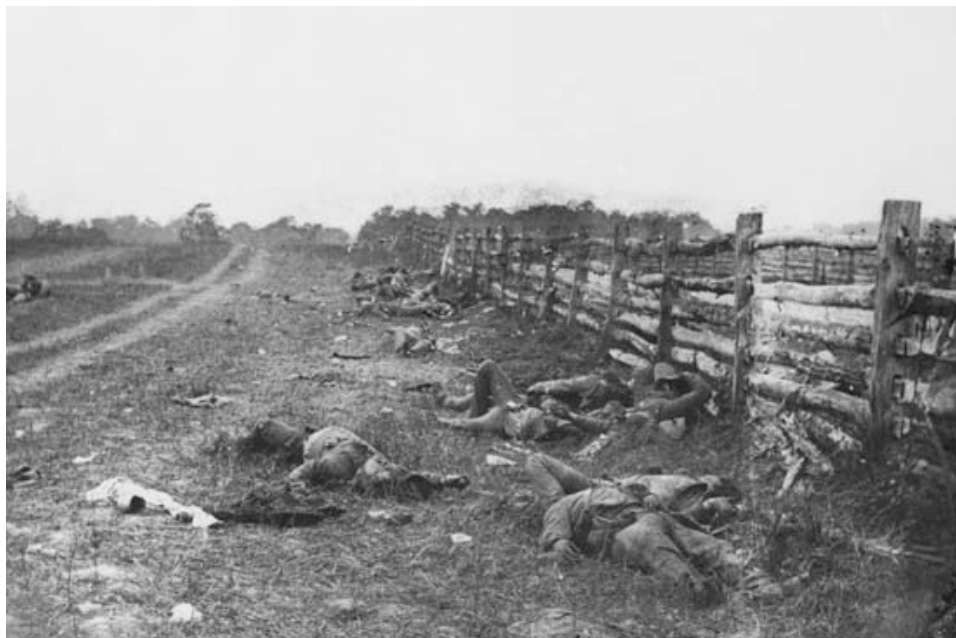
Battle of Antietam