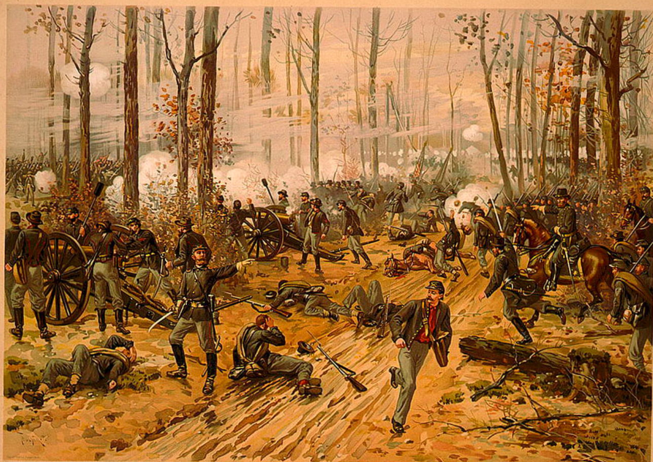
BATTLE OF SHILOH.