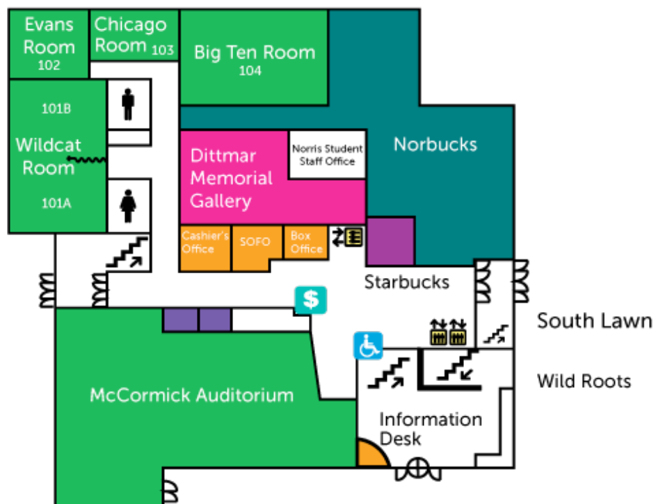
Norris - First Floor