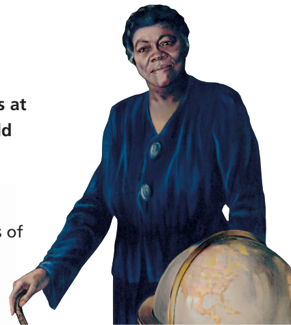
Mary McLeod Bethune was the first African-American woman to head a federal agency.

Mary McLeod Bethune, "Faith That Moved a Dump Heap"