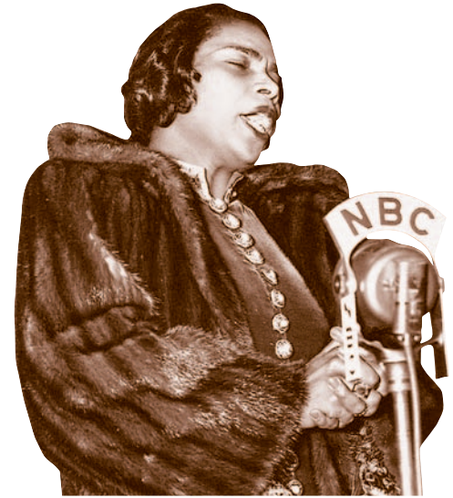
In early 1939, a women's group refused to rent a hall for opera star Marian Anderson's performance because of her race. So Mrs. Roosevelt asked her to sing at the Lincoln Memorial.

Life improved somewhat for Native Americans. In 1934, Congress passed the Indian Reorganization Act, which restored some reservation lands to Indian ownership. It also created the Indian Arts and Crafts Board to promote native arts.