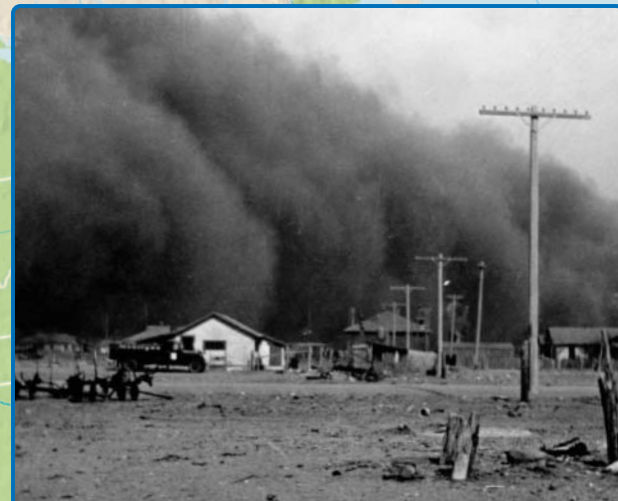
This photograph demonstrates why the dust storms were often called “black blizzards.”