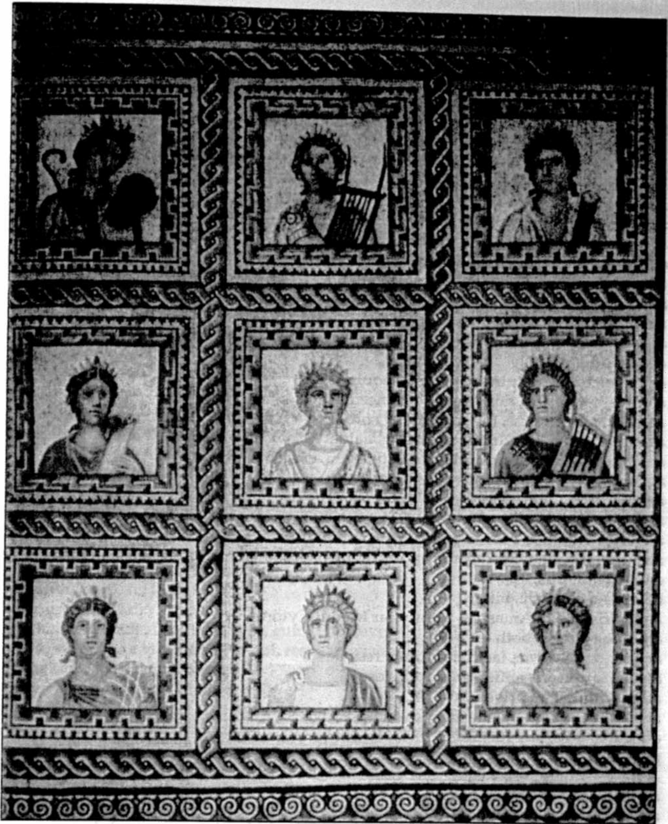
CARPET-MOSAIC OF THE NINE MUSES, THIRD CENTURY A.D., FOUND IN TRIER, GERMANY.