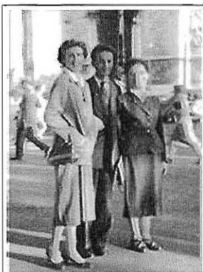
Wiesel and his surviving sisters

I remember: it happened yesterday, or eternities ago. A young Jewish boy discovered the Kingdom of Night. I remember his bewilderment, I remember his anguish. It all happened so fast. The ghetto. The deportation. The sealed cattle car. The fiery altar upon which the history of our people and the future of mankind were meant to be sacrificed.