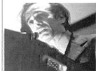
Wiesel delivering Nobel acceptance speech