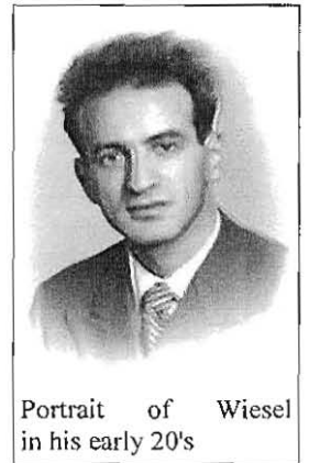
Portrait of Wiesel in his early 20's

There is so much to be done, there is so much that can be done. One person — a Raoul Wallenberg, an Albert Schweitzer, Martin Luther King, Jr. — one person of integrity, can make a difference, a difference of life and death. As long as one dissident is in prison, our freedom will not be true. As long as one child is hungry, our life will be filled with anguish and shame. What all these victims need above all is to know that they are not alone; that we are not forgetting them, that when their voices are stifled we shall lend them ours, that while their freedom depends on ours, the quality of our freedom depends on theirs.