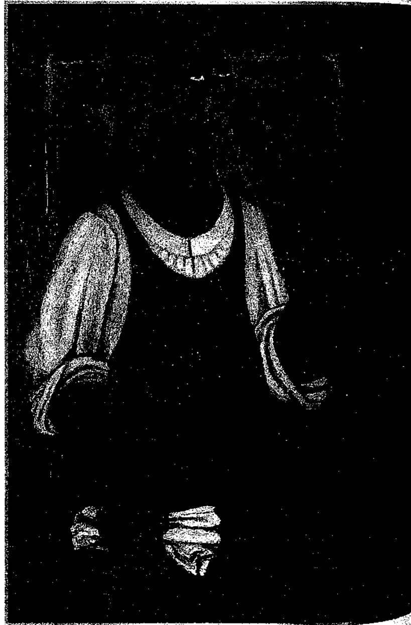
Working Woman (1947), Elizabeth Catlett. Oil on canvas, courtesy of the Barnett-Aden Collection, Museum of African American Art, Tampa, Florida.