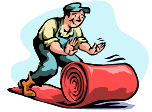
Rolling out the red carpet for you!