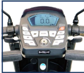
Control panel with LCD screen