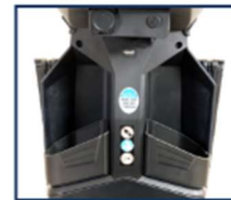
Two cup holders