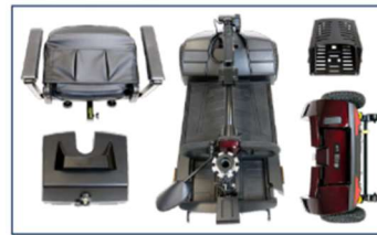
Disassembled for transport