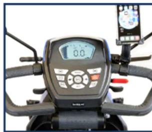
Control panel with LCD screen, cell phone holder, and Bluetooth sound bar