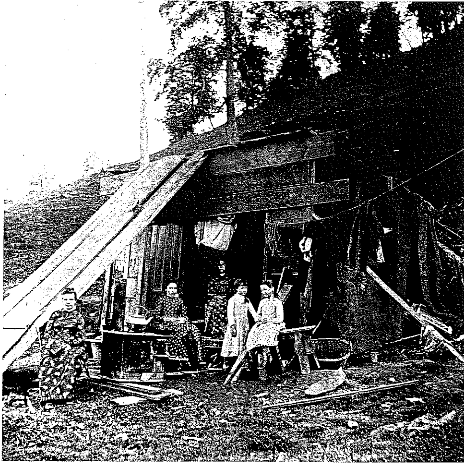
Survivors of the Johnstown flood take shelter in a cave.