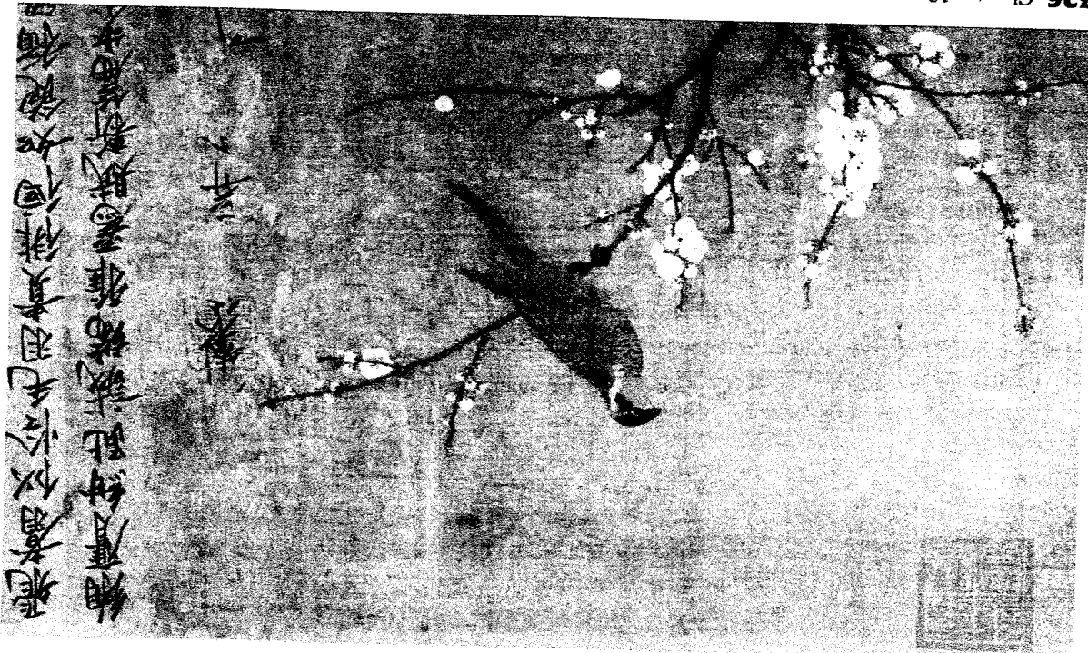
Birds and flowers were favorite subjects for Song painters. ▲

Chinese painting reached new heights of beauty during the Song Dynasty. Painting of this era shows Daoist influence. Artists emphasized the beauty of natural landscapes and objects such as a single branch or flower. The artists did not use bright colors. Black ink was their favorite paint. Said one Song artist, "Black is ten colors."