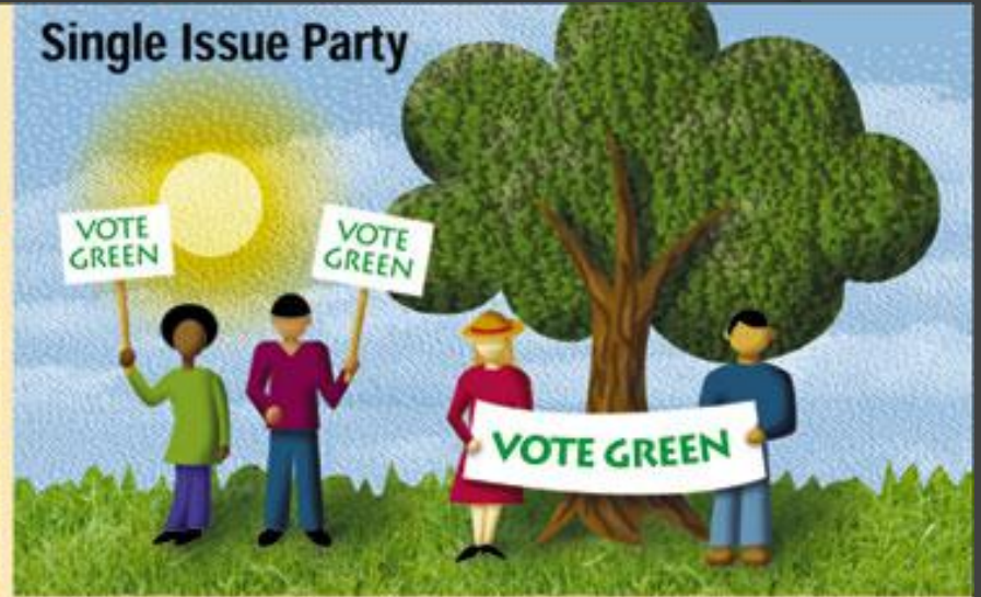
Single Issue Party